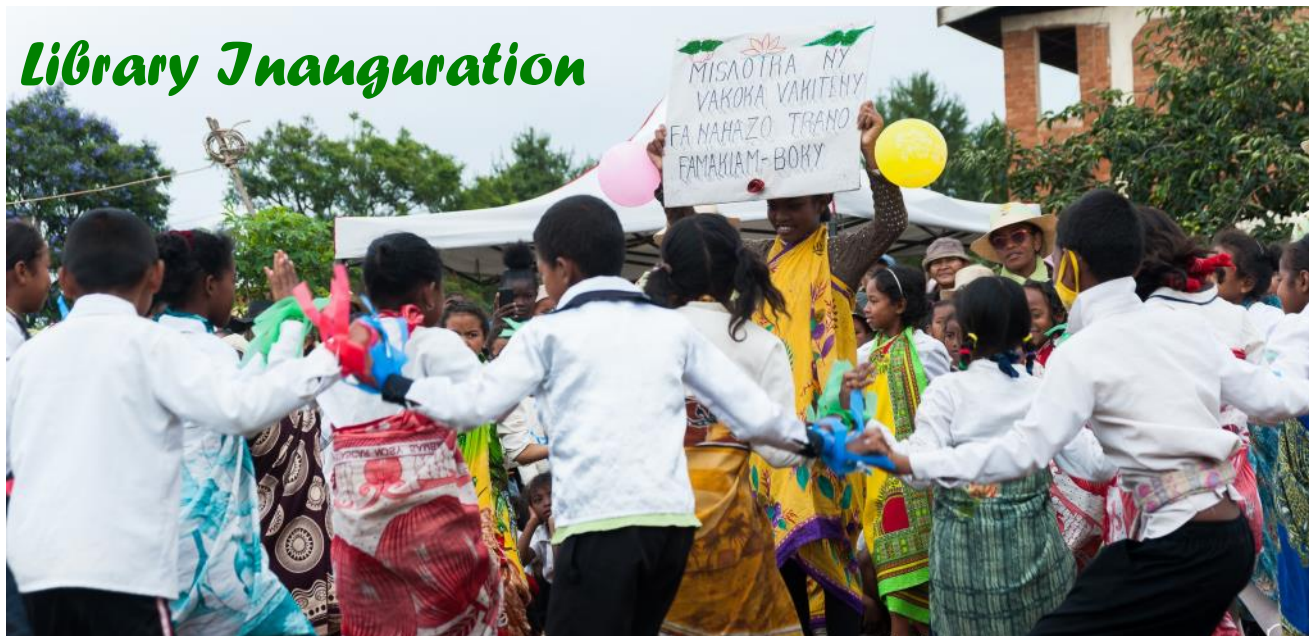
The children at Mahazorivo dance.

The newly built library at the school in Mahazoriavo was inaugurated on 21st December 2022. Hundreds of people, parents, students, teachers, and government officials came to celebrate the first library Vakoka Vakiteny has built in cooperation with the Association in Germany. A representative from the national television network and some private media outlets were also present. The director of the regional education office came himself and was very proud of what Vakoka Vakiteny did. The vice mayor of Antsirabe also attended.