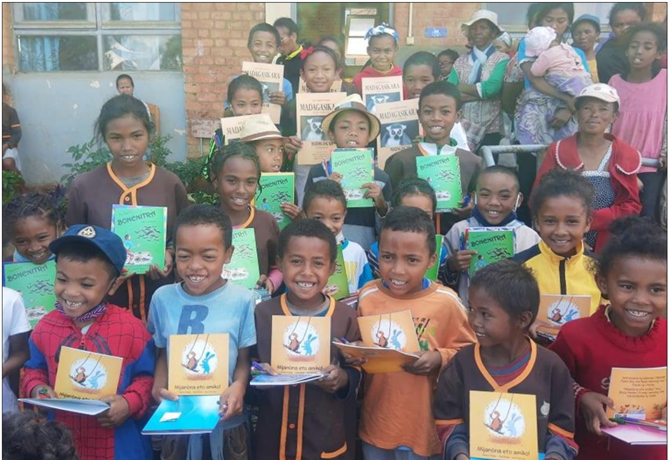
Children in Mahazoroivo got Bonenitra before Christmas.