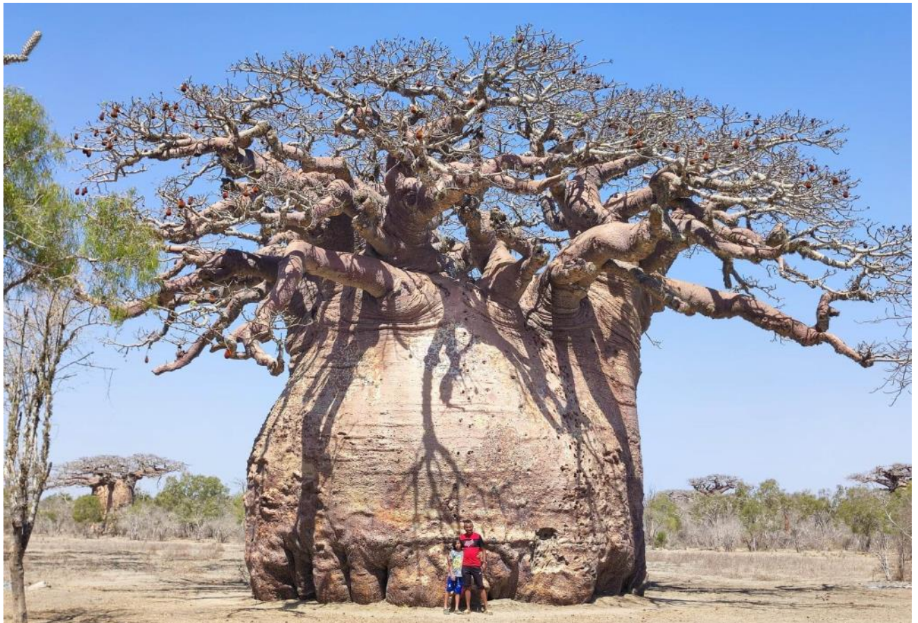
The biggest baobab in Andombiry, Madagascar