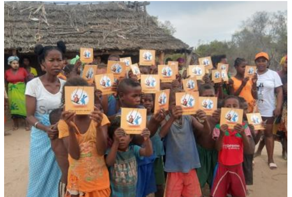
Teacher and children in Andombiry